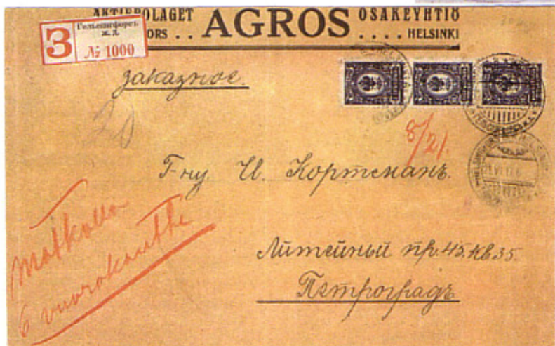
Figure 4, left. HELSINGFORS B. (railway station) 21. VI. 17, Petrograd 14. VI. 1917. Letter in transit six days. The label No. 1000 is the highest number for this label type.