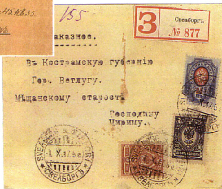
Figure 5, right. SVEABORG, 1. X. 17, via Helsingfors 1. X. 1917, to Vetluga - -1917. Letter weight 12 gram, postage 15 kopeks, registration 20 kopeks. The cover was returned and re-mailed. Cover was opened and inspected by the Helsinki war censor, markings on the inside.