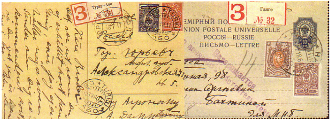
Figure 6. ÅBO-TURKU 29.VII.17, to Jurev 18. VII. 19(Russian calendar). The Jurev arrival mark is partly on top of label. Rare bi-lingual Turku-Åbo 3-label in Russian.