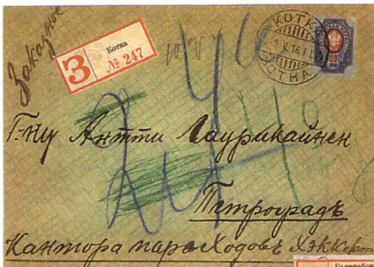
Figure 2, left. KOTKA 9. V. 16, to Petrograd 27. IV. 1916, postage and registration each 10 kopeks. On the cover front and reverse side there are many notations. On the cover left upper corner the word "Заканное" was written, "registered" in Russian.