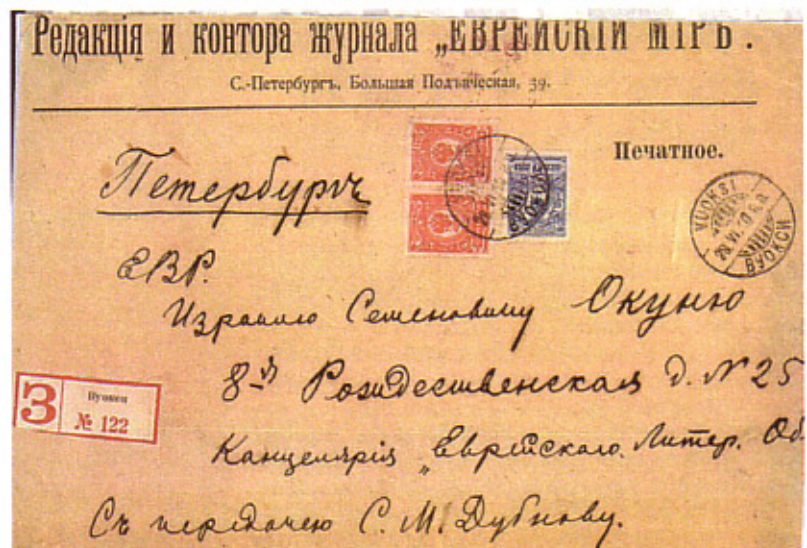
Figure 1. VUOKSI, 28. VI. 10, to St. Petersburg, 16. VI. 1910. Printed matter item. The 3-labels were introduced in 1910. Helsinki, 26. IV. 10 is the earliest recorded date for this type registration label.